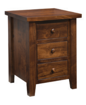
3-DRAWER NIGHTSTAND 22½"W x 29½"H x 20"D MKNS-40