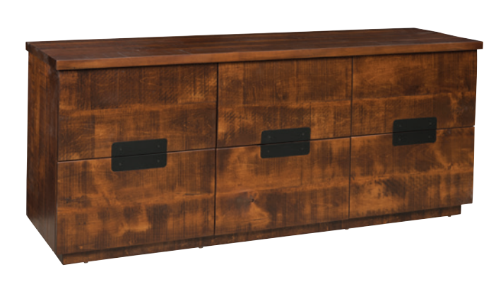
6-DRAWER DRESSER 69"W x 25½"H x 20"D HFDR-57