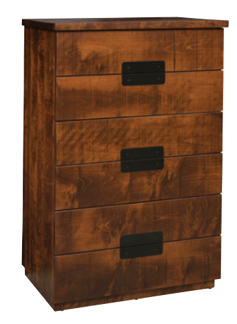
6-DRAWER CHEST 32"W x 46"H x 20"D HFCH-61