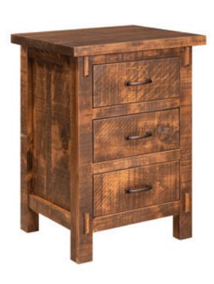
3-DRAWER NIGHTSTAND 22½"W x 30"H x 19"D RSNS-40