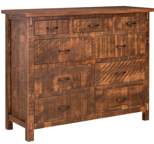
9-DRAWER DRESSER 56"W x 44"H x 20"D RSDR-50