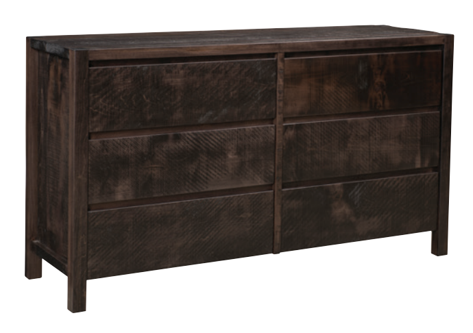
6-DRAWER DRESSER 59"W x 37"H x 20½"D BBDR-54