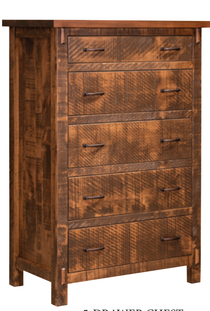
5-DRAWER CHEST 36"W x 52"H x 20"D RSCH-61