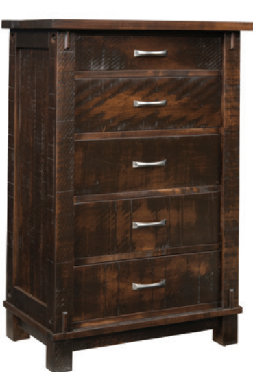
5-DRAWER CHEST 21"W x 53"H x 36"D BRCH-61