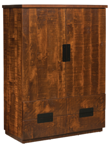
ARMOIRE 45"W x 57½"H x 20"D HFAM-67