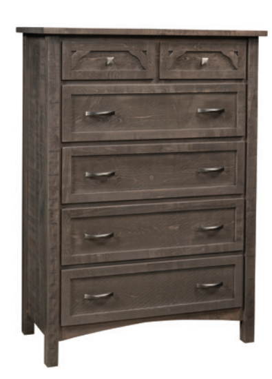
6-DRAWER CHEST 40"W x 551/2"H x 201/2"D SCCH-60