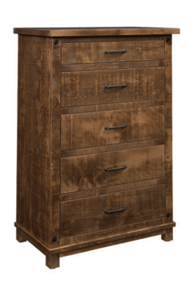
5-DRAWER CHEST 35½"W x 52"H x 20"D SNCH-61