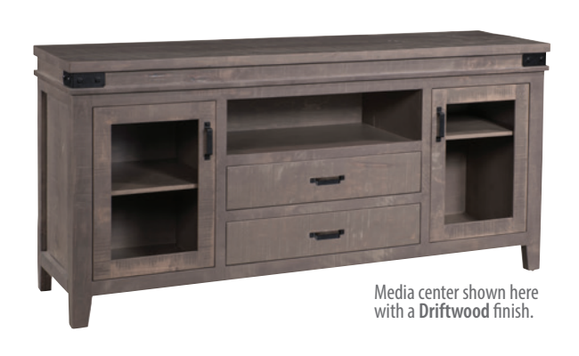
MEDIA CENTER 72"W x 34½"H x 20¼"D CBMC-91