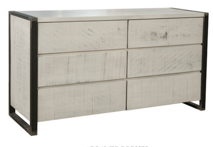
6-DRAWER DRESSER 66"W x 36"H x 21"D JMDR-56