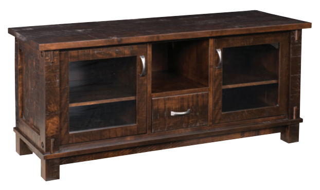
MEDIA CENTER 65"W x 30½"H x 21"D BRMC-90