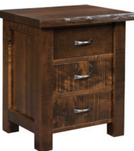
3-DRAWER NIGHTSTAND 26"W x 29"H x 20"D LENS-40