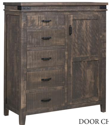
DOOR CHEST 48"W x 55"H x 20¾"D CBCH-62