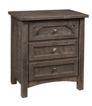
3-DRAWER NIGHTSTAND 25"W x 28½"H x 18½"D 5CNS-40