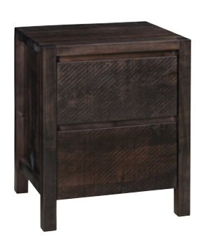
2-DRAWER NIGHTSTAND 22"W x 26½"H x 18½"D BBN5-42