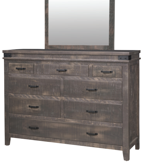
8-DRAWER DRESSER 60"W x 451/2"H x 20"D CBDR-52