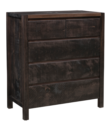
5-DRAWER CHEST 37½"W x 47"H x 20½"D BBCH-61