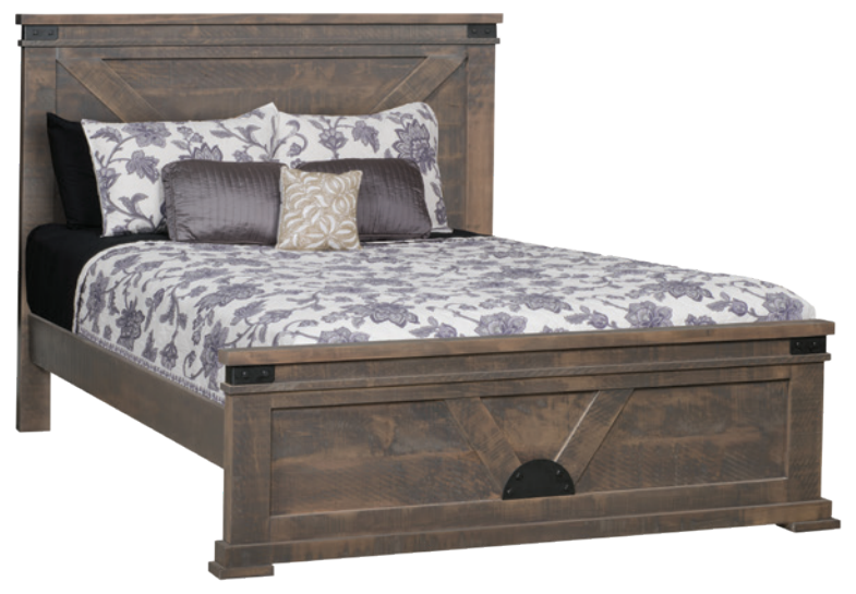
QUEEN BED HEADBOARD: 67½"W x 55"H FOOTBOARD: 67½" x 24¼"H CBQB-12