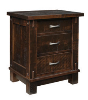
3-DRAWER NIGHTSTAND 26"W x 301/4"H x 20"D BRNS-40