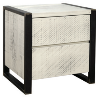
2-DRAWER NIGHTSTAND 30"W x 24"H x 20"D JMNS-42