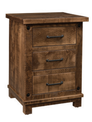
3-DRAWER NIGHTSTAND 22"W x 30"H x 19"D SNNS-40