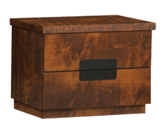
2-DRAWER NIGHTSTAND 24"W x 15"H x 18½"D HFNS-42