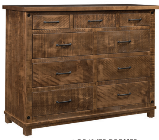
9-DRAWER DRESSER 55½"W x 44"H x 20"D SNDR-50