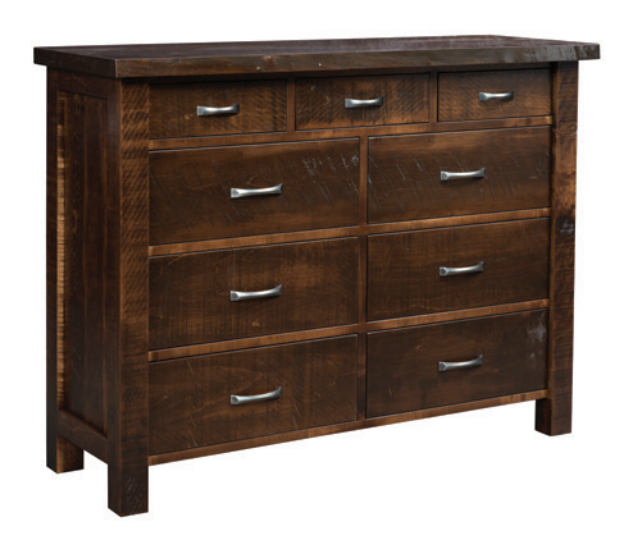
9-DRAWER DRESSER 61"W x 44"H x 21"D LEDR-50